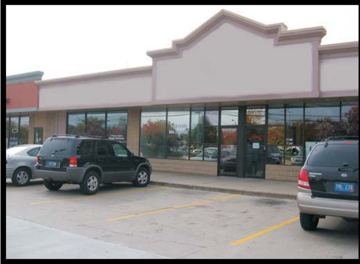
2012-2336 S. Mission St.

Stadium Mall is an established 57,000 square foot retail development adjacent to CMU's football stadium and across the street from the Mt. Pleasant Shopping Center that houses Big K and JCPenney. Target, ABC Warehouse, Kohls, Sam's Club and Super WalMart are within 1/2 mile.